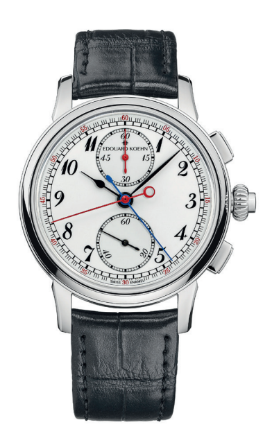
50 PIECES LIMITED EDITION IN STEEL 316L FK-CHR11SS-SL-WFFL-ASBK

This caliber operates at a frequency of 28,800 (4 Hz) with 31 jewels, 282 components part and has a 48-hour power reserve. Entirely manufactured by Concepto Watch Factory in La Chaux-de-Fonds, Switzerland. It is fitted with a Top chronometer quality regulating organ.