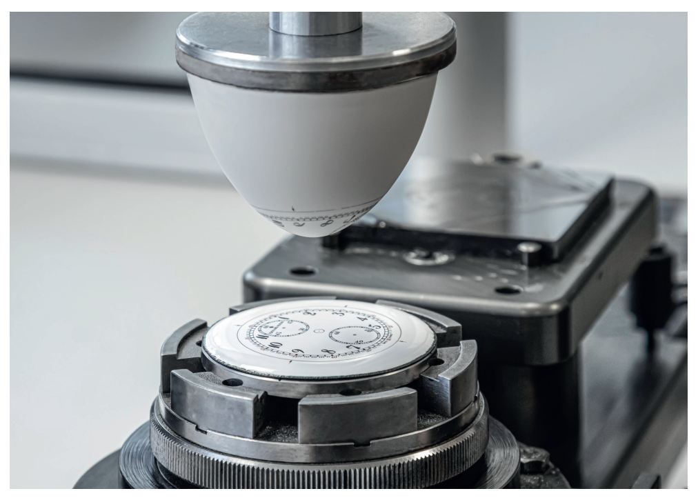
STAMPING THE ENAMEL DIAL WITH MARKINGS