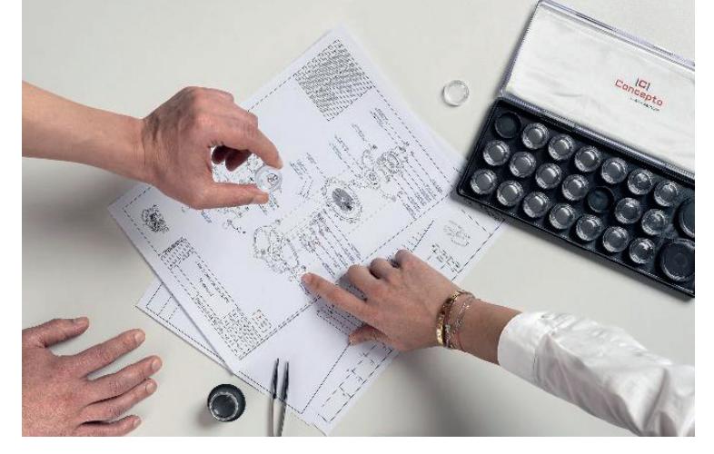
DESIGN AND R & D DEPARTMENTS IN COLLABORATION WITH CONCEPTO WATCH FACTORY